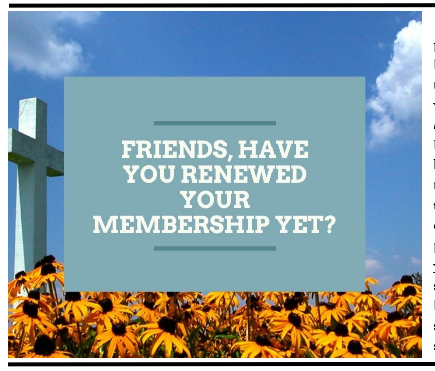
THE FINER POINTS

Available at all three Friends Museum store locations; St. Clement's Island, Piney Point Lighthouse & the Old Jail Museum. Also available online with shipping through the Friends Museum Store. https://friendsmuseumstore.square.site/