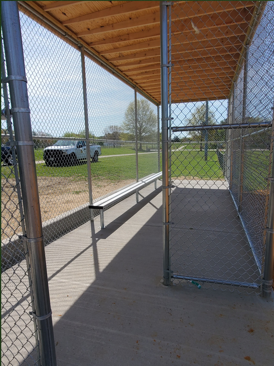
Chancellors Run Regional Park