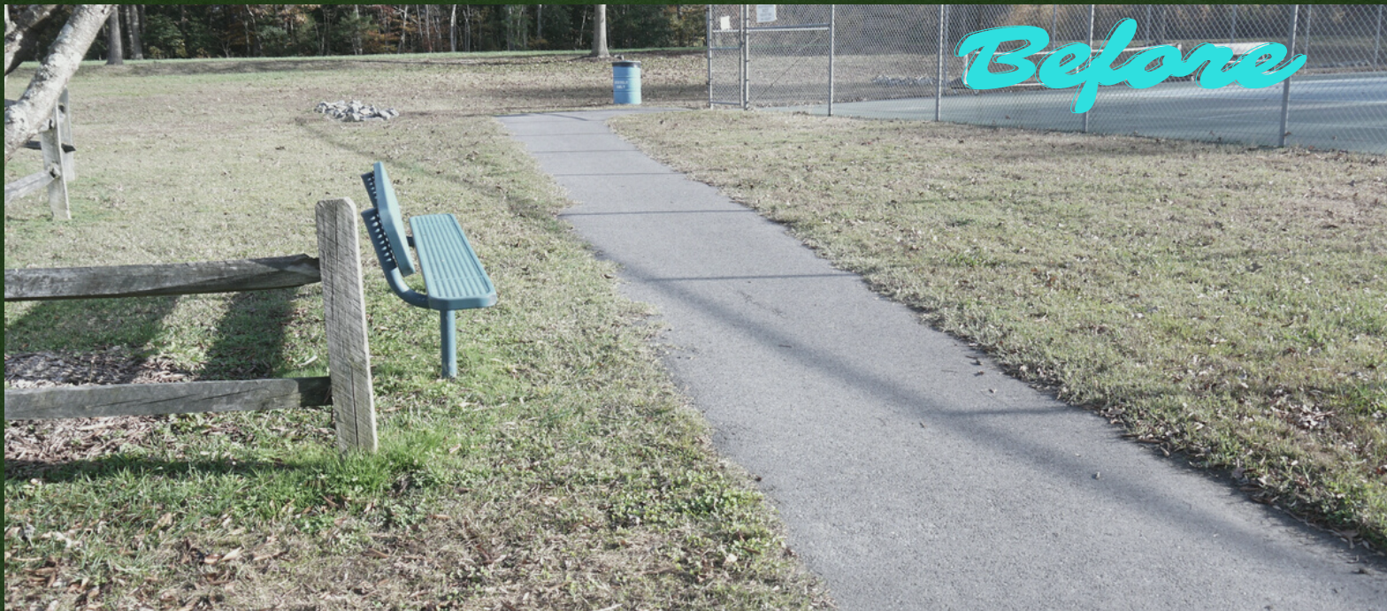
Baggett Park- court entrances