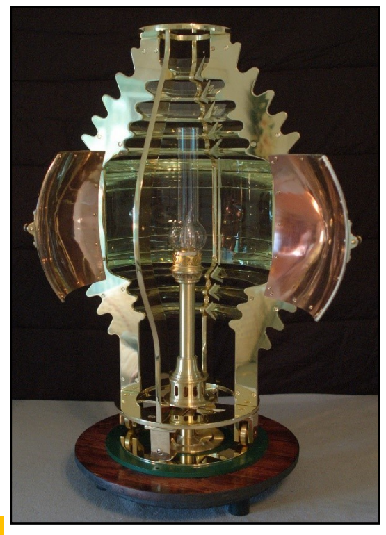
5th Order Fesnel Lens

Use this link for more information and to donate today: bit.ly/BringHomeTheLight