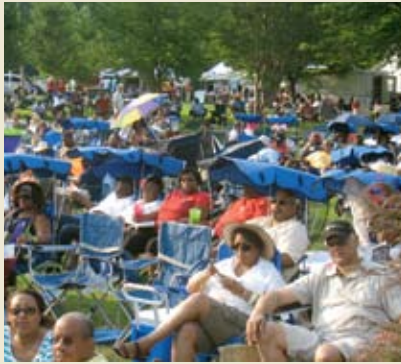
The Potomac Jazz & Seafood Festival was sold out for the second year in a row with over 800 in attendance.