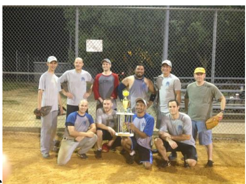
Church Softball League