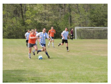
Adult Coed Soccer